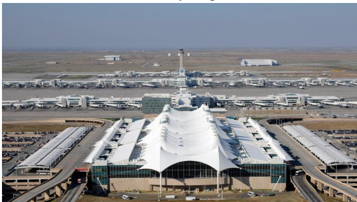
Figure 2. Denver International Airport 3D modeling stages in Revit

Real-world example: In the renovation of Denver International Airport (Figure 2), BIM clash detection optimized logistics and planning and reduced construction time by 10 percent.