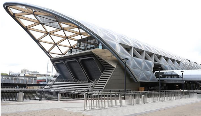
Figure 1. Crossrail project (London)

Time savings: Projects using BIM technology save an average of 20 percent of time. For example, the Crossrail project (London) (Figure 1), a complex project over 100 kilometers long, involving 30 different organizations and 10,000 workers. With the help of BIM technology, the time spent working together was significantly reduced.